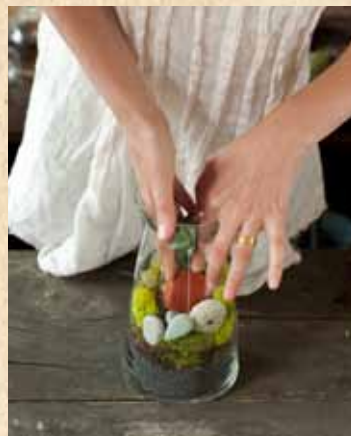
NO. 10 Slip potted plant into hole in center of moss