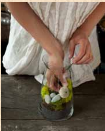
NO. 9 Add sea urchins against glass