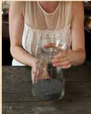
NO. 3 Give container a shake or two to level sand