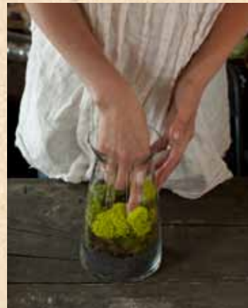
NO. 7 Add small pieces of reindeer moss