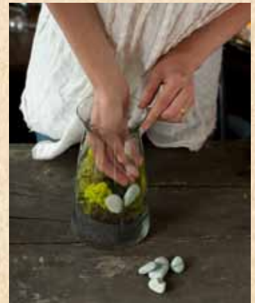
NO. 8 Arrange rocks by sliding them down the sides of the terrarium