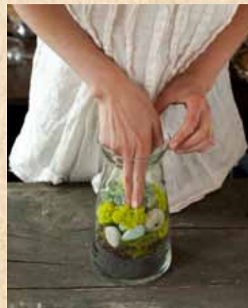
NO. 11 Add remaining reindeer moss to conceal pot