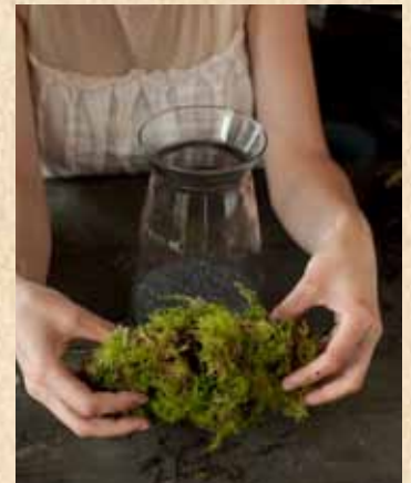
NO. 4 Loosen moss clump, without actually separating pieces