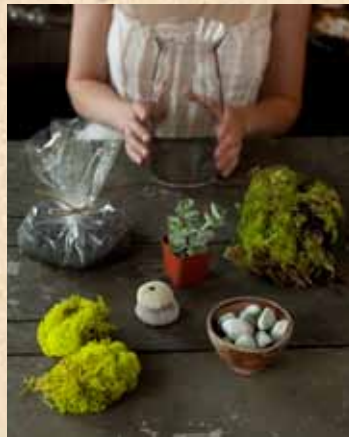
NO. 1 Assemble your materials

These two illustrated, step-by-step designs offer a basic primer in some essential terrarium techniques.