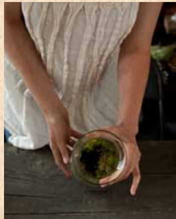
NO. 6 Form a hole in moss toward the center for potted plant