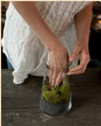
NO. 5 Drop loosened moss clump down into container and arrange so fluffy pieces are facing up and out