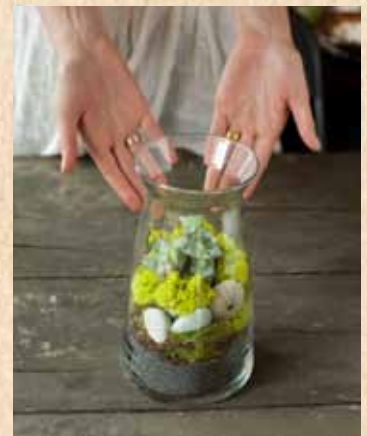
NO. 12 Voila—done!