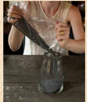
NO. 2 Pour sand into terrarium